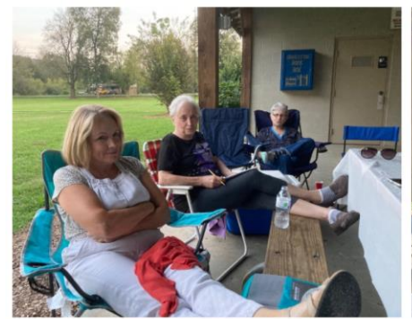
OCT 14, 2021 MONTHLY CLUB MEETING