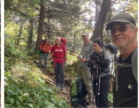
OCTOBER 9, 2021 JOHN MUIR TRAIL WORKTRIP AND CLEANUP